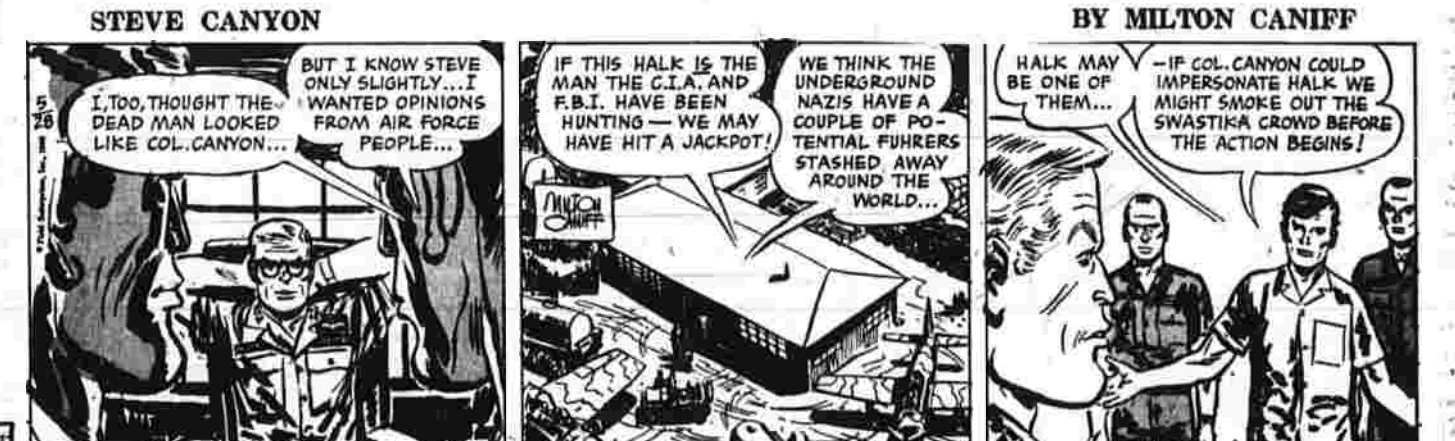
BY MILTON CANIFF